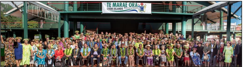
2018 ANNUAL HEALTH CONFERENCE – National Auditorium