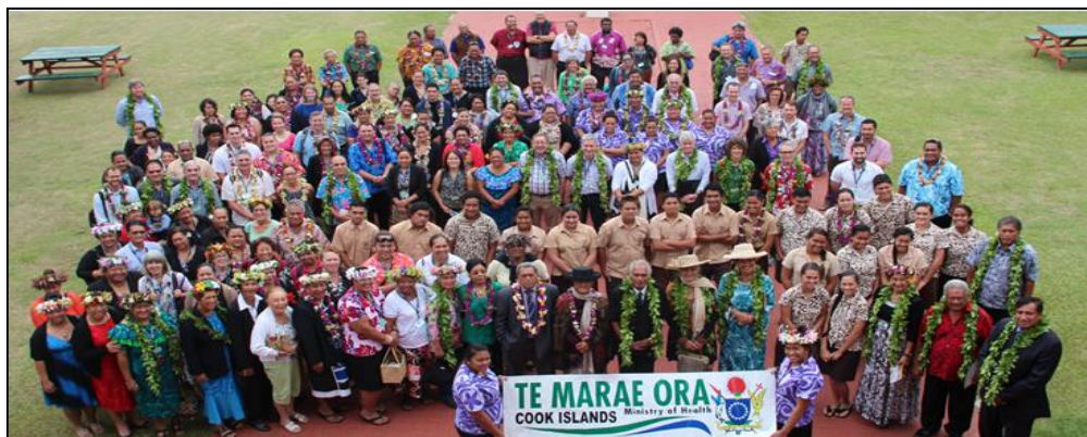
2014 ANNUAL HEALTH CONFERENCE – National Auditorium