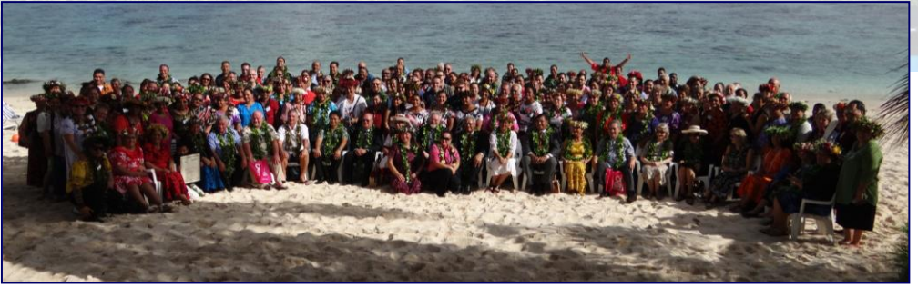
2017 ANNUAL HEALTH CONFERENCE – Edgewater Resort