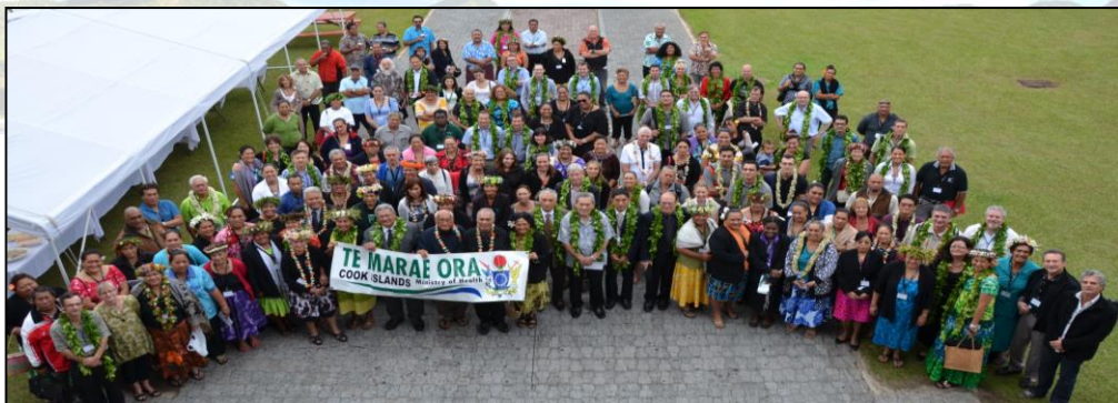
2012 ANNUAL HEALTH CONFERENCE – National Auditorium