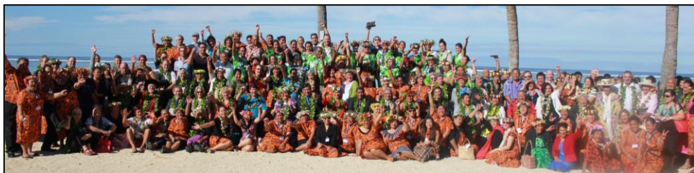
2015 ANNUAL HEALTH CONFERENCE – Rarotongan Hotel