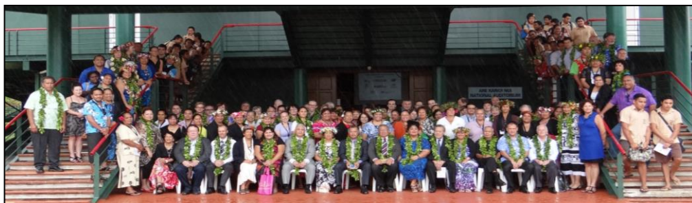
2013 ANNUAL HEALTH CONFERENCE – National Auditorium