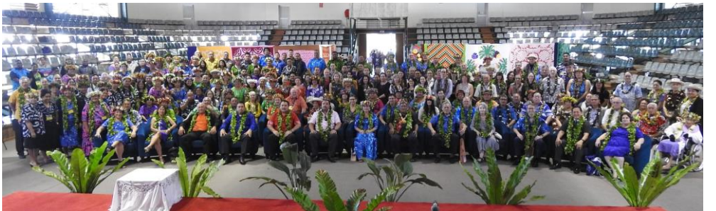
2019 ANNUAL HEALTH CONFERENCE – National Auditorium