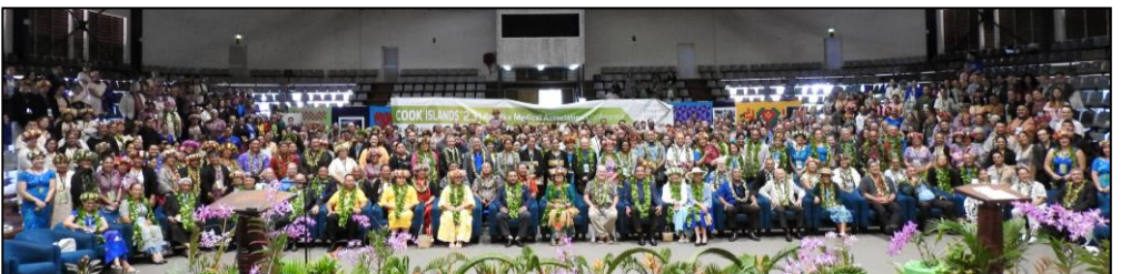
2023 ANNUAL HEALTH CONFERENCE – National Auditorium